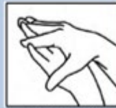
The back of the hands