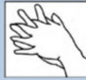
In between the fingers