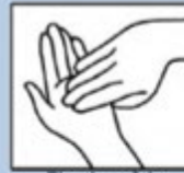
The tips of the fingers