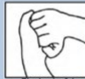
The back of the fingers